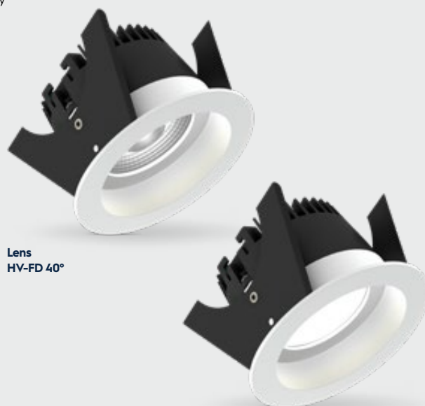
Lens HV-FD 40°